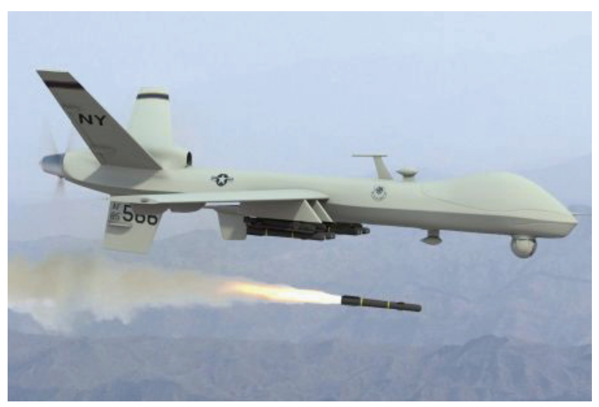
While international legal standards encourage states to review new weapon systems for their compliance with international law, the United States said it did not need to review the newly weaponized Predator drone, shown here firing a Hellfire missile. It argued that the drone and missile had already received approval separately, at a time when the Predator was used for surveillance.

it was to be armed, had previously passed reviews when considered separately.<sup>88</sup> An ICRC guide to Article 36, however, says reviews should cover "an existing weapon that is modified in a way that alters its function, or a weapon that has already passed a legal review but that is subsequently modified."<sup>89</sup> This rule is especially important for robots because they are complex systems that often combine a multitude of components that work differently in different combinations.