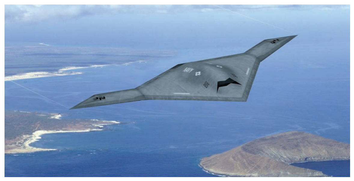
The US Navy's X-47B, currently undergoing testing, has been commissioned to fly with greater autonomy than existing drones. While the prototype will not carry weapons, it has two weapons bays that could make later models serve a combat function.

The United Kingdom unveiled a prototype of its Taranis combat aircraft in 2010. Designers described it as "an autonomous and stealthy unmanned aircraft" that aims to strike "targets with real precision at long range, even in another continent."<sup>61</sup> Because Taranis is only a prototype, it is not armed, but it includes two weapons bays and could eventually carry bombs or missiles.<sup>62</sup> Similar to existing drones, Taranis would presumably be designed to launch attacks against persons as well as materiel. It would also be able to defend itself from enemy aircraft.<sup>63</sup> At this point, the Taranis is expected to retain a human in the loop. The UK Ministry of Defence stated, "Should such systems enter into service, they will at all times be under the control of highly trained military crews on the ground."<sup>64</sup> Asked if the Taranis would one day choose its own targets, Royal Air Force Air Chief Marshal Simon Bryant